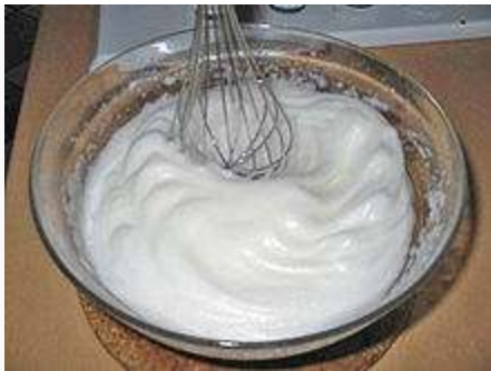
Beaten egg whites

When egg whites are beaten, some of the hydrogen bonds in the proteins break, causing the proteins to unfold ("denature") and to aggregate non-specifically. This change in structure leads to the stiff consistency required for meringues. The use of a copper bowl, or the addition of cream of tartar is required to additionally denature the proteins to create the firm peaks, otherwise the whites will not be firm. Plastic bowls, wet or greasy bowls will likely result in the meringue mix being prevented from becoming peaky. Wiping the bowl with a wedge of lemon to remove any traces of grease can often help the process.